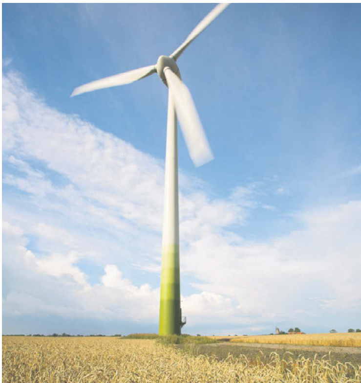
Providence Bay wind farm on Manitoulin Island, Ontario.

By supporting a green energy provider such as Bullfrog, companies can help Canada become a centre of expertise and excellence in clean energy globally, he adds, which can also be good for the country's bottom line. "The future is in green power."