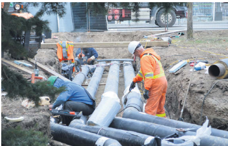
Workers install pipes at Guelph's Sleeman Centre, which will be part of North America's first city-wide district energy network. In addition to bringing massive savings in fuel, equipment and maintenance costs, this initiative will lead to a much smaller environmental footprint.

The Scotiabank EcoLiving Awards, which generate public interest in residential energy efficiency, offer a combined $75,000 annually to recognize businesses, entrepreneurs and students who are advancing business and residential energy innovation. "We want our Scotiabank EcoLiving website to be a comprehensive resource that raises awareness of the benefits of energy efficiency and sustainable practices, influ-