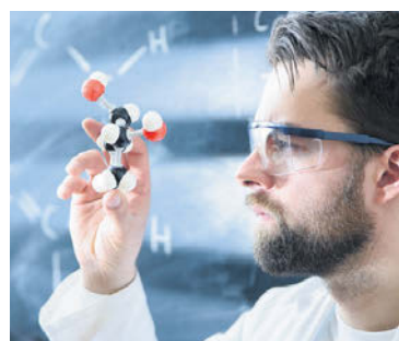
Clean tech innovations help to facilitate the shift to a lower carbon economy.

The focus on sustainability boosts the sector's strength as it makes it less vulnerable to market whims. One example is consumer perception – a factor that