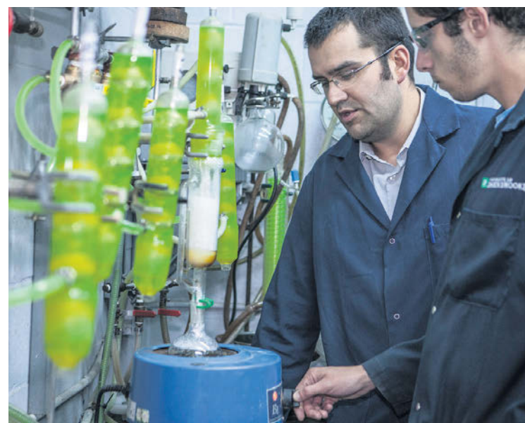
Research efforts at facilities like JML Lab are advancing Canada's potential for the development of biofuels.