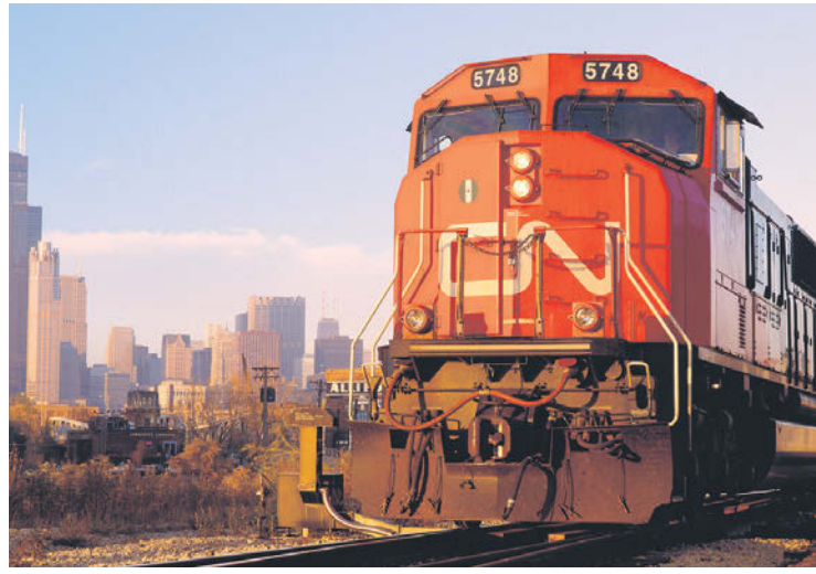
The goals of CN’s EcoConnexions program include conserving energy, reducing waste and improving housekeeping at CN yards and offices across North America. CN

In addition to getting employees on board, CN has also had success working with utility providers to eliminate energy waste and improve energy efficiency.