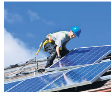
The drop of price in solar technology and investment-friendly government policy can encourage solar energy growth.

The growth, almost all of which is in Ontario, has been driven by investment-friendly provincial government policies and the dramatic drop in the price of solar technology, from about $4 per watt for a solar panel in 2008 to around 69 cents today.