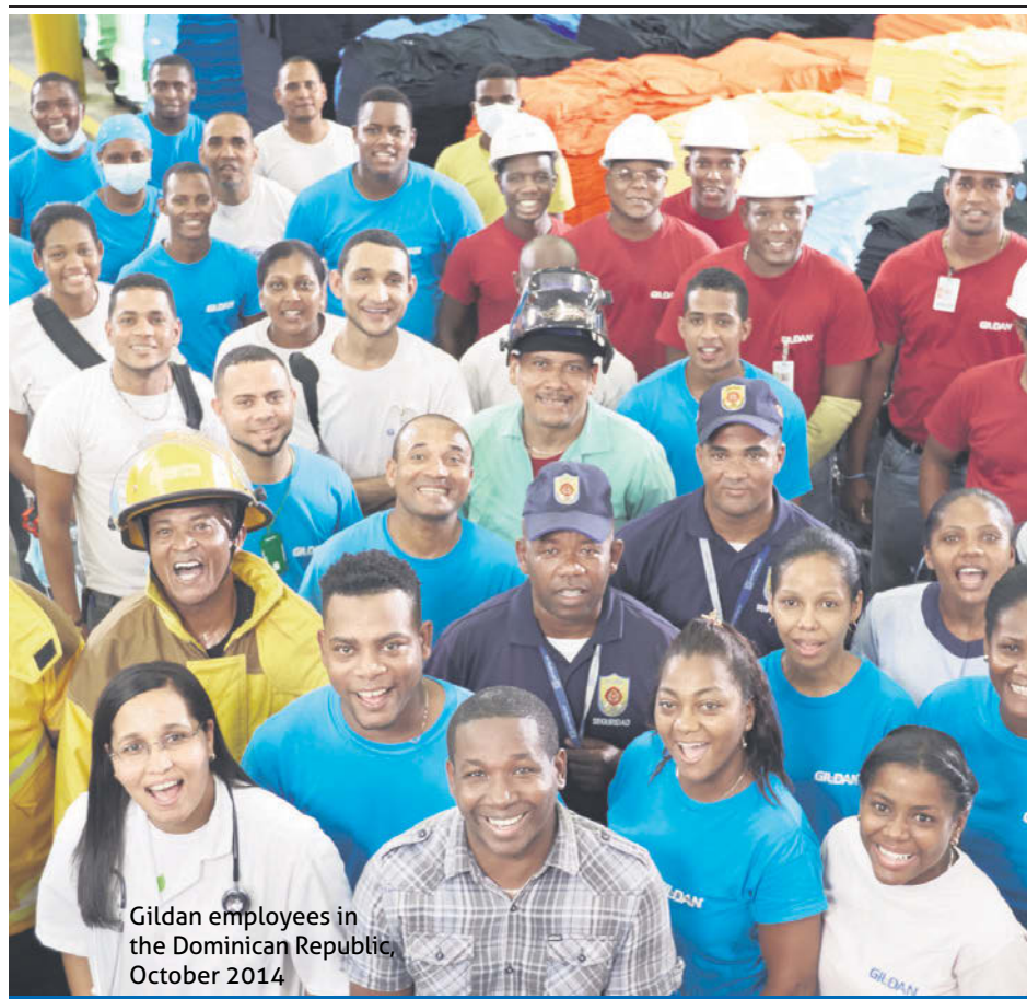
Gildan employees in the Dominican Republic, October 2014

"People want to connect with brands that offer the products and services they need, but also stand for something: brands that reflect their values. For companies like MEC, investments in this area prioritize real business issues like climate change and allow them to demonstrate their brand authenticity by acting on what their members and customers care about," she adds.